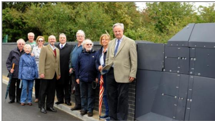
The bridge at Brinkworth following the cladding

The cladding could turn into shrapnel if vehicles hit the side of the bridge which could potentially cause harm to pedestrians or other road users and, for these reasons, Network Rail cannot pursue this option.